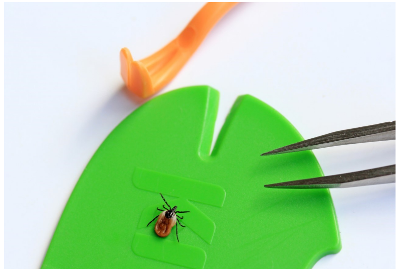
There are various tools that can help remove ticks.

Want to learn more? Take our Sickness Prevention in Horses short course for practical knowledge on ways to keep your horses healthy and protected from getting sick.